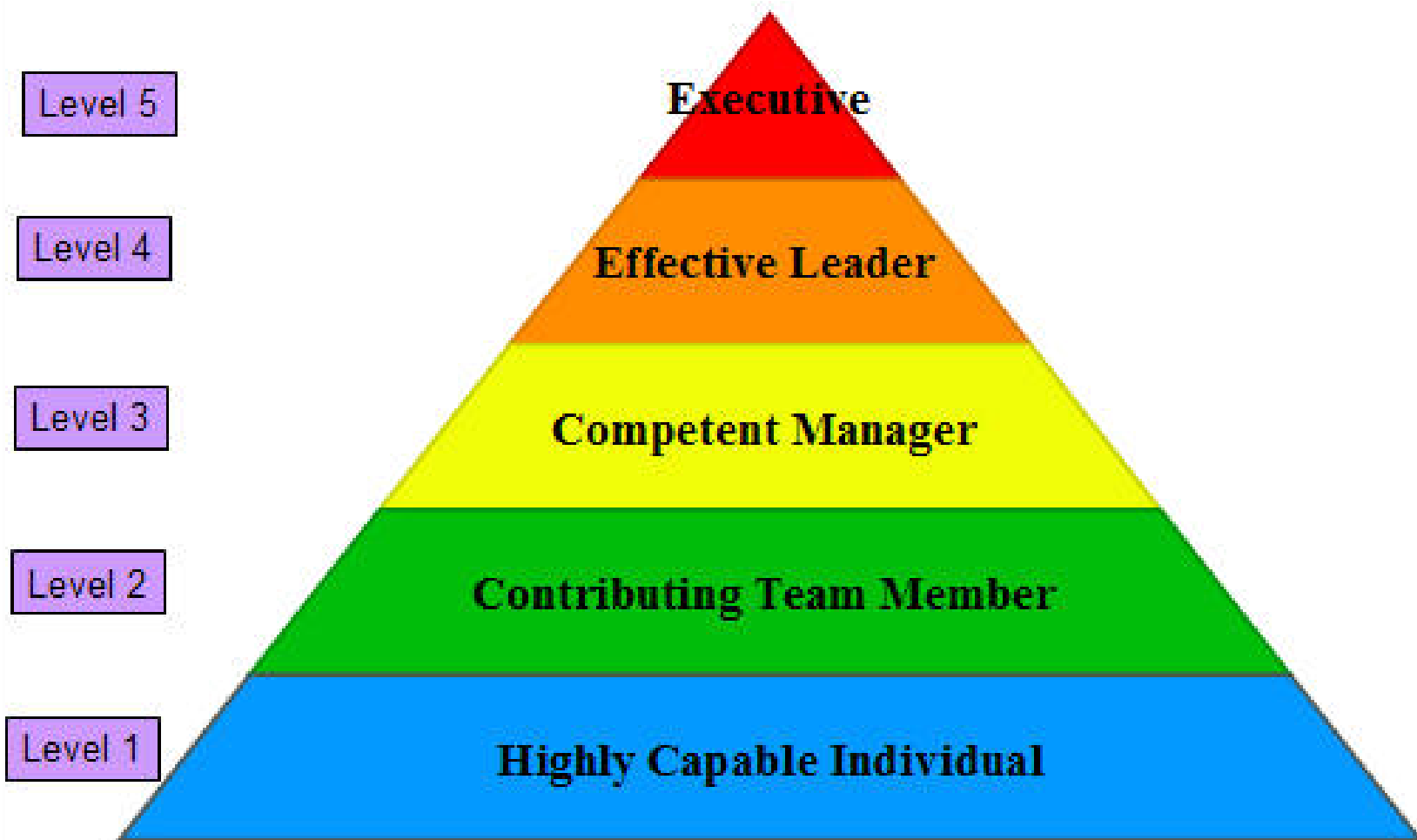
Level 5 Hierarchy